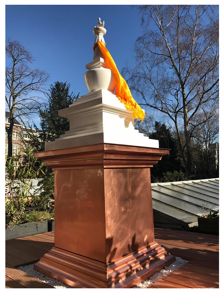
Enlightenment Stupa guarding over us on the roof terrace of NCN