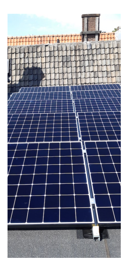
New solar panels!

With the help of a number of earmarked and sizeable donations from community members and a bequest from a dearly deceased sangha member, three large-scale improvements to the building took place in 2022, largely aimed at sustainability and energy conservation. A professional supplier installed 15 solar panels on the flat roof at the rear of the building which have since contributed significantly to reducing the electricity bill.