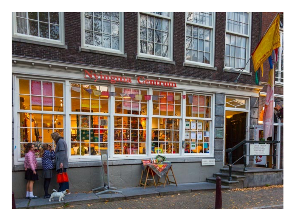
Frontside NCN building at Reguliersgracht