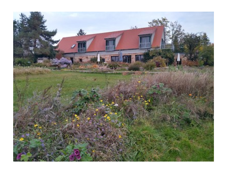
retreat center in Neu Plaue