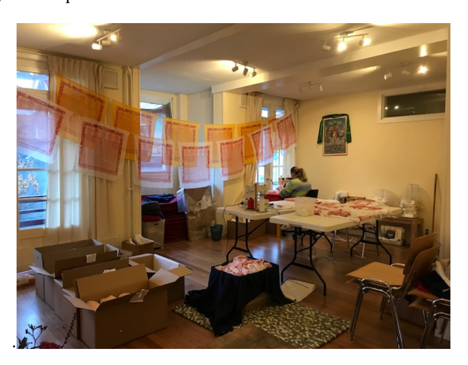
Liza working on prayerflags in the second floor studio

In 2022, the first 3,000 flags for the Netherlands and Germany were printed by Grafica do Dharma in Brazil and sent to us. Donations were collected in the sangha to pay for materials and transport and sewing machines. Aided by advice from Rita Toledo and Claudio Moraes, who have been working in the Brazilian centers for some time on the production of prayer flags, the Nyingma Centers in Amsterdam and Cologne each put together a team who hemmed and sewed the prayer flags in series to flag string. Enthusiasm for participation and donations was aroused by two lectures in June on the power of prayer flags and by a workshop on Sacred Energy led by Marianne Moerbeek in August. The Dutch team led by Liza de Kiewit and the German team led by Betty Karov managed to finish the 3,000 flags before the end of 2022 and to send them to Odiyan where they are now flying for world peace – especially in Europe.